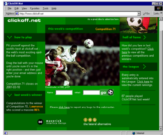
clickoff - drag the ball to the correct position...

Successfully marketed in Germany and the UK, ClickOff.net demonstrates what can be done with a simple concept, well-executed.