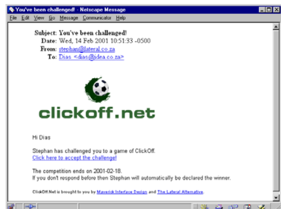
clickoff email integration...Challenge a Friend... await the Results