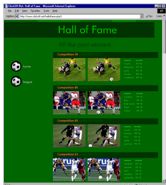
clickoff - view past competitions and winners

http://www.clickoff.net http://www.clickoff.co.za